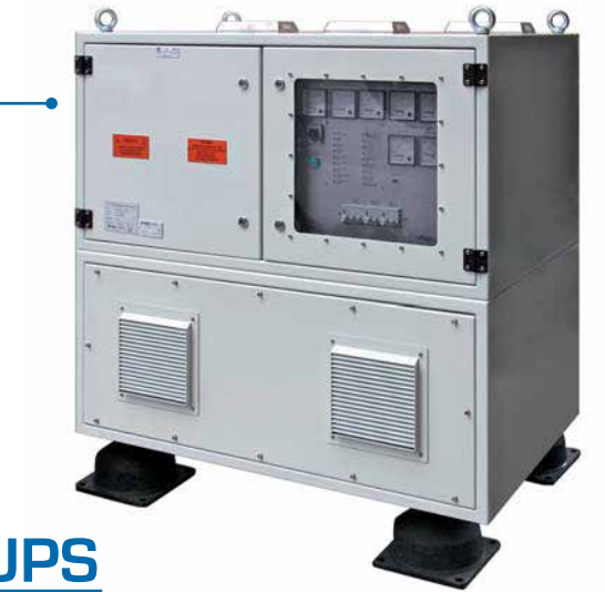
UPS 10 kVA