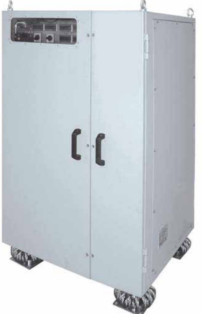
UPS 6 kVA