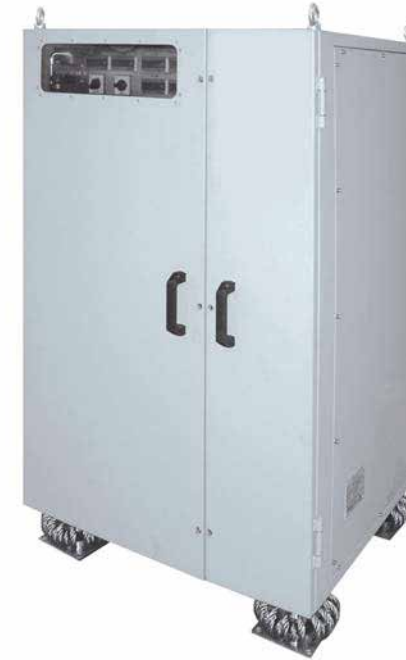
UPS 3 kVA