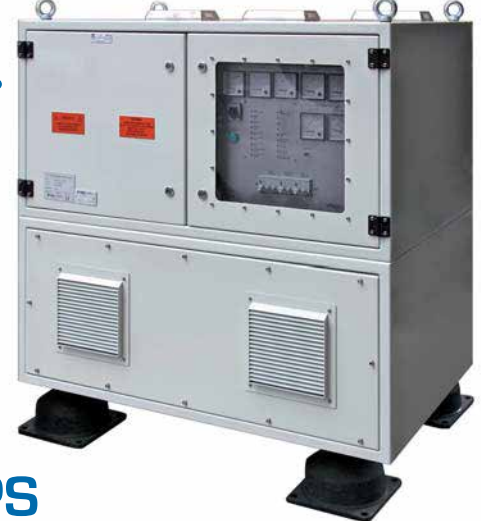
UPS 10 kVA