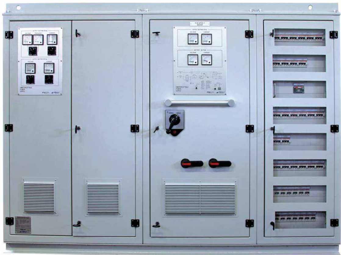
UPS 120 kVA